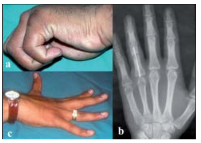
Figure 5: (a) Clinical photograph of adventitious bursitis at the site of entry portal in one patient (b) X-ray depecting of backing of nails causing adventitious bursitis. (c) Clinical photograph of 5° extension lag at proximal interphalangeal joint in one of the patients

Intramedullary nailing of long bones of hand was introduced fairly recently.<sup>6.25</sup> The concept is similar to the flexible nailing technique of Ender and Simon Weidner<sup>9</sup> for the treatment of fractures of long bones. The main advantage of this technique is that it is simple, safe, joint-sparing and can be performed as a daycare procedure thus reducing the cost. It provides adequate stability due to three-point fixation