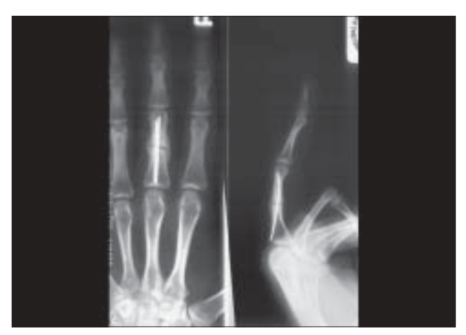
Figure 4: Anteroposterior and lateral X-ray views show radiological evidence of union in six weeks

cross K-wires have reported to create distraction of fracture fragments causing delayed union and nonunion.<sup>24</sup>