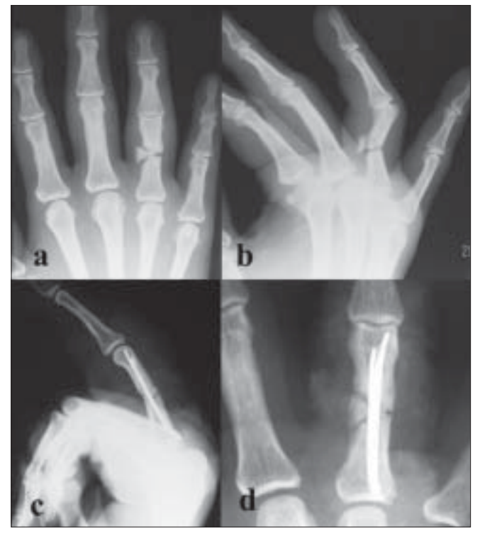
Figure 3: (a) AP view (b) lateral view of left hand shows unstable segmental proximal phalangeal fracture. Postoperative AP and lateral X-ray (c and d) of left hand of same patient shows segmental fracture fixed with multiple nails

Patankar and Meman: Intramedullary nailing of proximal phalangeal fractures of hand